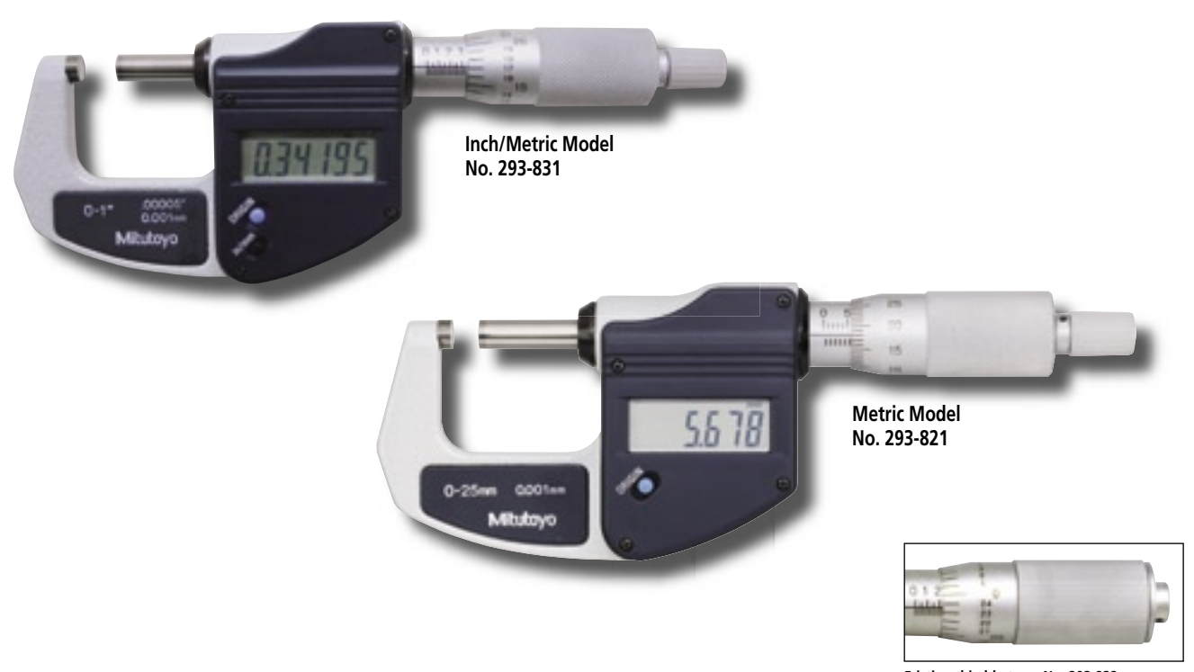
Friction thimble type: No. 293-832

Introducing Mitutoyo's newly designed digital micrometer